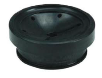
PART #: Mount Adapter Allows use with existing 3 bolt flange hardware

(continuous feed models / sold separately)