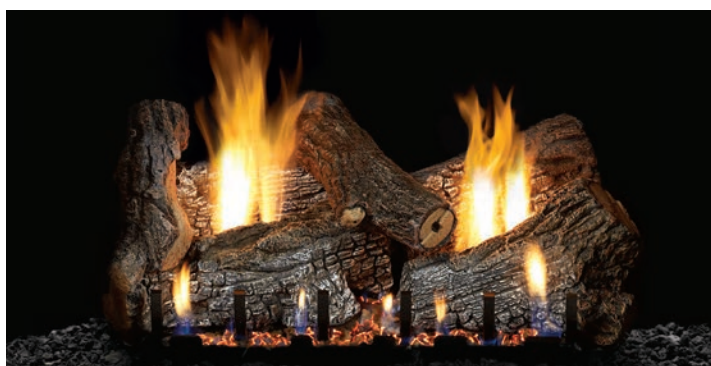
Sassafras Refractory Log Set (LS-24RS) with Vent-Free Slope Glaze Burner System (VFSR-24)