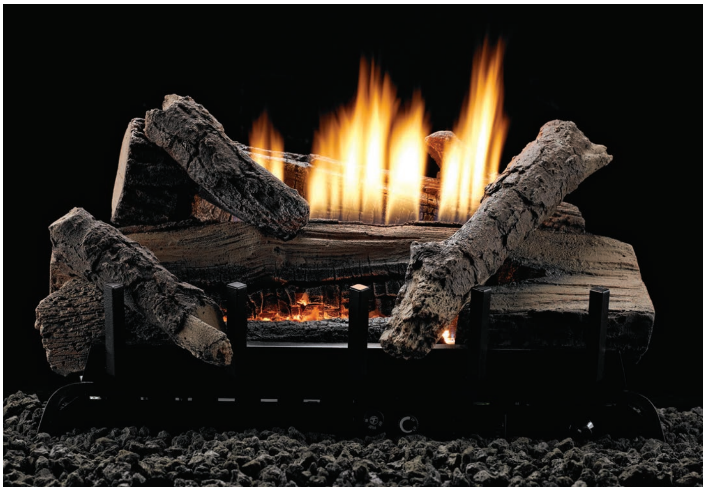
Whiskey River Refractory Log Set and Vent-Free Burner Combination (VFDR-18-LBW)

The Flint Hill and Whiskey River are also offered in 10,000 Btu models for bedroom applications, where allowed by code.