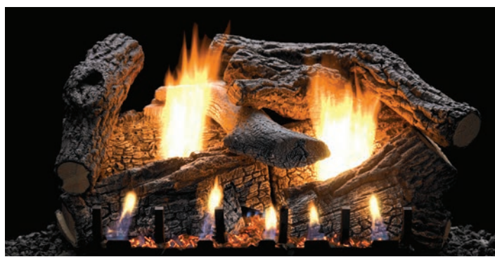
Super Sassafras Refractory Log Set (LS-24RSS) with Vent-Free Slope Glaze Burner System (VFSR-24)