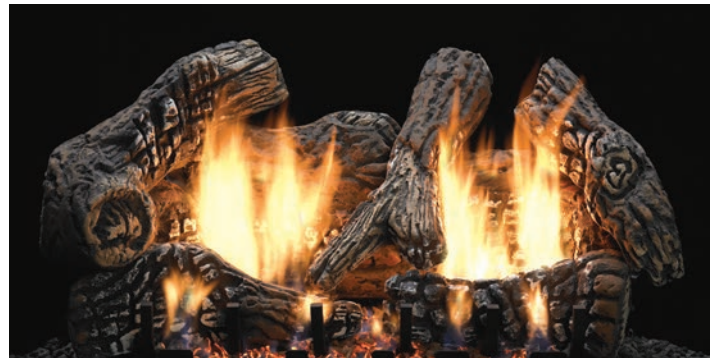
Super Charred Oak Ceramic Fiber Log Set (LS-24C2S) with Vent-Free Slope Glaze Burner System (VFSR-24)