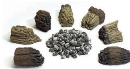
EK-2 Large Ember Kit available for Multi-sided log sets or large fireplaces.