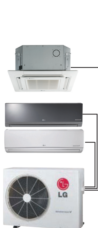
Figure 2: Tri-Zone (LMU240HV and LMU24CHV) Multi F Heat Pump Inverter System — Mix and match for 14,000-33,000 Btu/h (ODU Appearances Will Vary)..