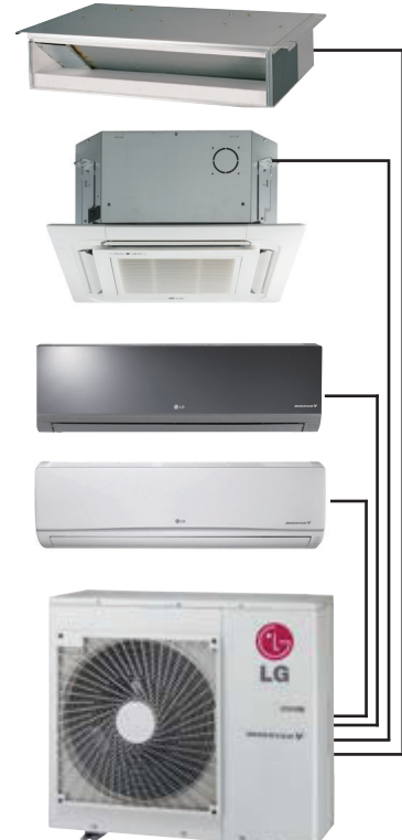
Figure 3: Quad-Zone (LMU30CHV and LMU36CHV) Multi F Heat Pump Inverter System — Mix and match for 14,000-40,000 (LMU30CHV) and 14,000-48,000 Btu/h (LMU36CHV).