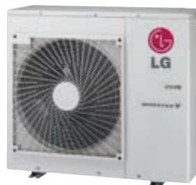
Quad-Zone Multi F