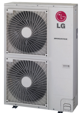
Eight-Zone Multi F MAX