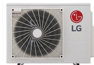
Dual and Tri-Zone Multi F