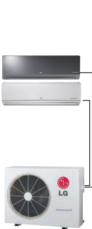
Figure 1: Dual-Zone (LMU180HV and LMU18CHV) Multi F Heat Pump Inverter System — Mix and match for 14,000-24,000 Btu/h (ODU Appearances Will Vary).

Multi F / Multi F MAX Heat Pump System Combination Data Manual