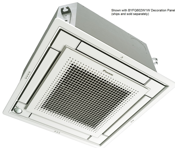
Shown with BYFQ602W1W Decoration Panel (ships and sold separately)