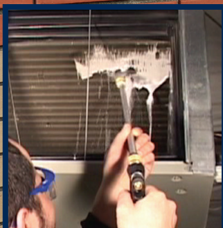
Easy cleaning in any situation