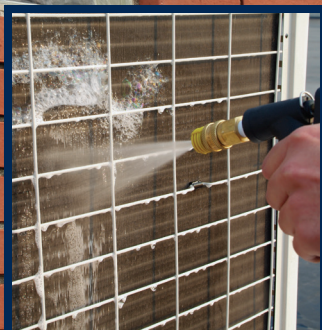
Fine or wide spray

The CoilJet delivers a powerful spray of water and cleaning chemical from the included tanks to wash even the dirtiest coils, without damaging sensitive fins. And the small portable size lets you clean coils from the front or back of the coil – a proven method for increasing coil cleaning and system efficiency. CoilJet makes cleaning coils quick and easy. Now that's smart.